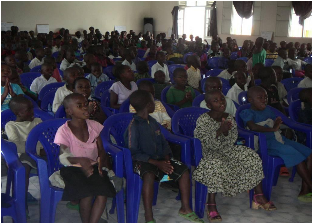
Children Voice Learning Centre, DRC/Eastern Region