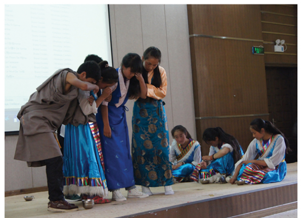
Students perform Milarepa in English

SEP concluded with a Final Performance on August 17 when students displayed their knowledge and skills. They showcased a mix of Tibetan and English songs and dances. The main feature was a theatrical rendition of Milarepa in English by the drama class. The event also included an auction led by students from the social entrepreneurship class that raised over 2,500 RMB!