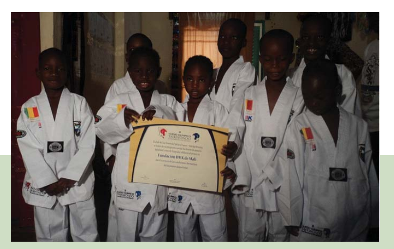
Tae Kwon Do Class

The ACFA board has almost doubled and this increased strength in capacity has helped us to successfully grow the programs of ACFA-Mali. One strength is the establishment of a fundraising committee.