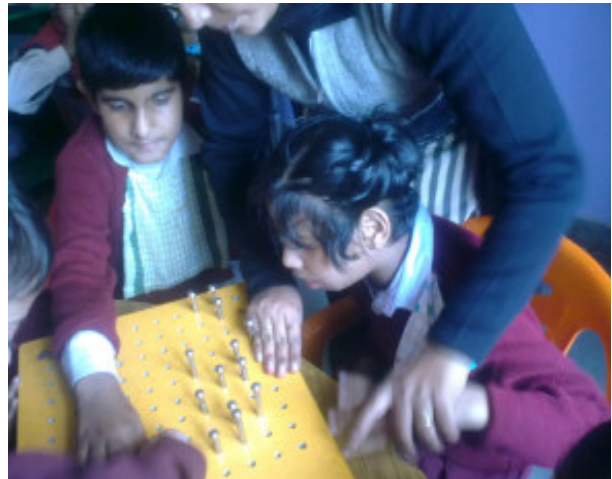
Students in Special Education Unit

In the primary group, children are trained in Activities of Daily Living and given exercises to maximize their skills. In the secondary level they are trained in academics and other skills. Four of our children with Downs syndrome and MR will be placed in the preschool that we are planning at Dwarka center from the coming academic year. At Dakshinpuri , there are 7 children undergoing training.