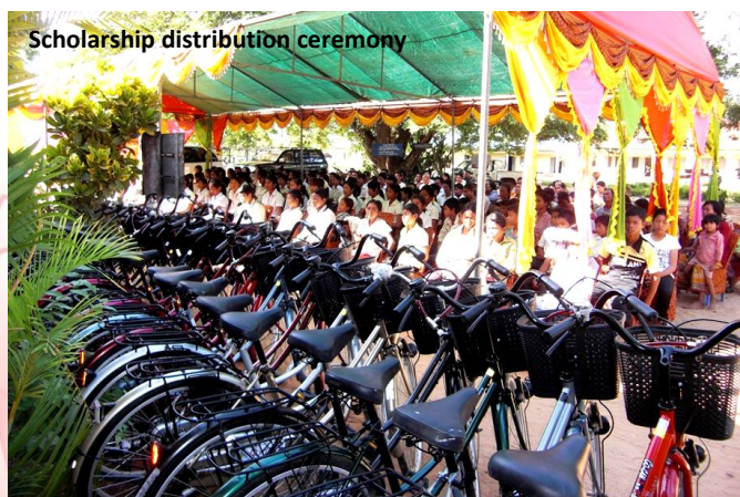
Scholarship distribution ceremony

Here are just a few of the wonderful outcomes achieved by our team on the ground during the first six months of the program: