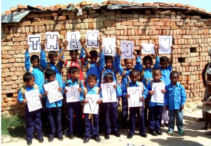
Child laborers in Mewat saying "thank you!" to our donors

When we originally set out to raise $4,000 for 200 scholarships for child laborers in India, we didn't hold our breath. Times are tough all over the world -- people are losing their jobs and their homes, political crises are mounting in places such as Sri Lanka and Darfur, and natural disasters continue to strike East and Southeast Asia. But somehow a miracle happened: nearly every one of our supporters stepped up and spread the word, and we managed to not only secure enough funding for 700 scholarships, but we fully funded our LEARN program for the rest of the year!