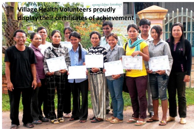
Village Health Volunteers proudly display their certificates of achievement

Earlier this year, Lotus Outreach began partnering with the Cambodian Organization for Children and Development (COCD) to establish an exciting new mobile health, food security and education outreach program in the Phnom Kravanh district of Cambodia's Pursat Province. This integrated development program, entitled 'Rural and Marginalized Community Access to Education, Health and Food Security,' is working tirelessly to improve primary healthcare, increase food security and nutrition, and expand access to education for 5,167 rural villagers and ethnic minorities in Samroung, Phnom Kravanh.