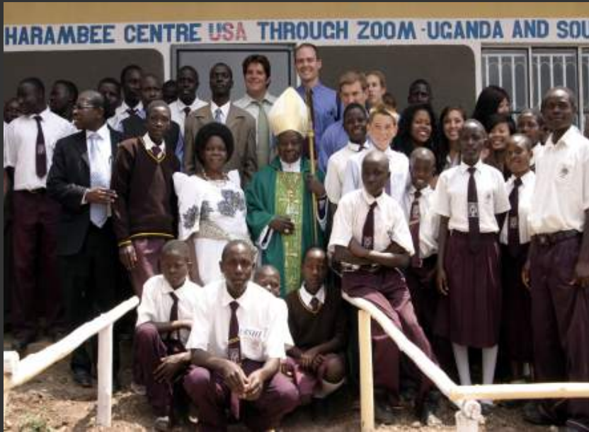
Laboratory Opening, Aug 2008