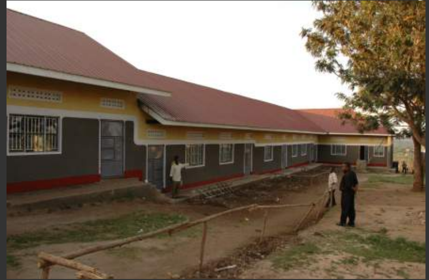
Laboratory, July 2008