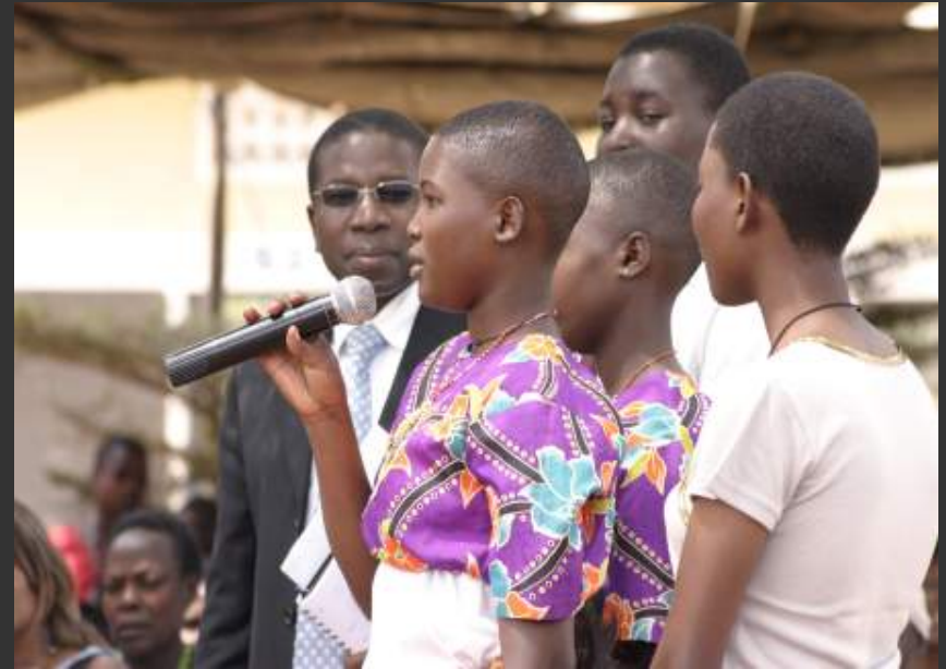
Laboratory, July 2008