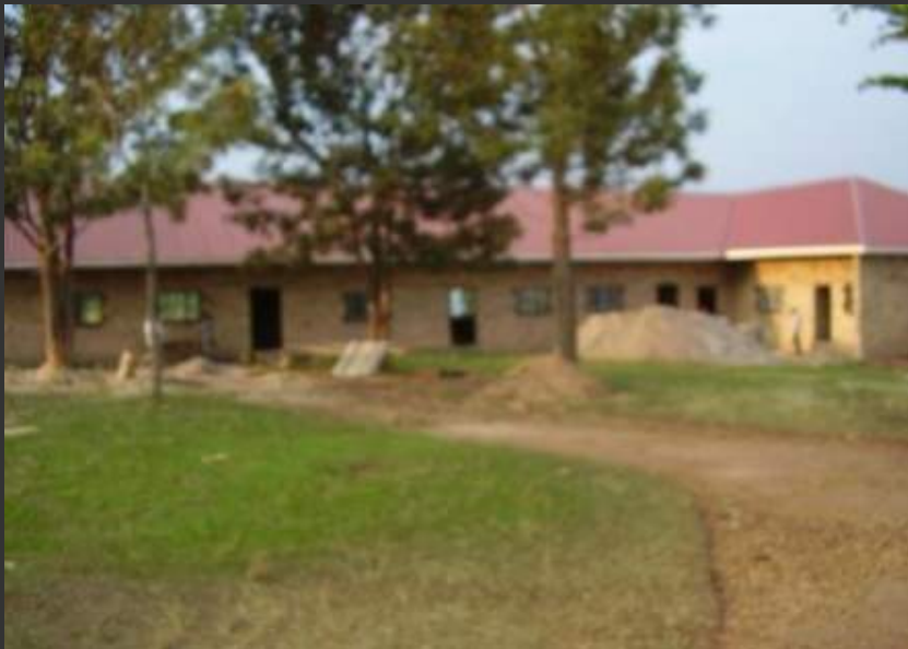
Laboratory Construction, Feb 2007