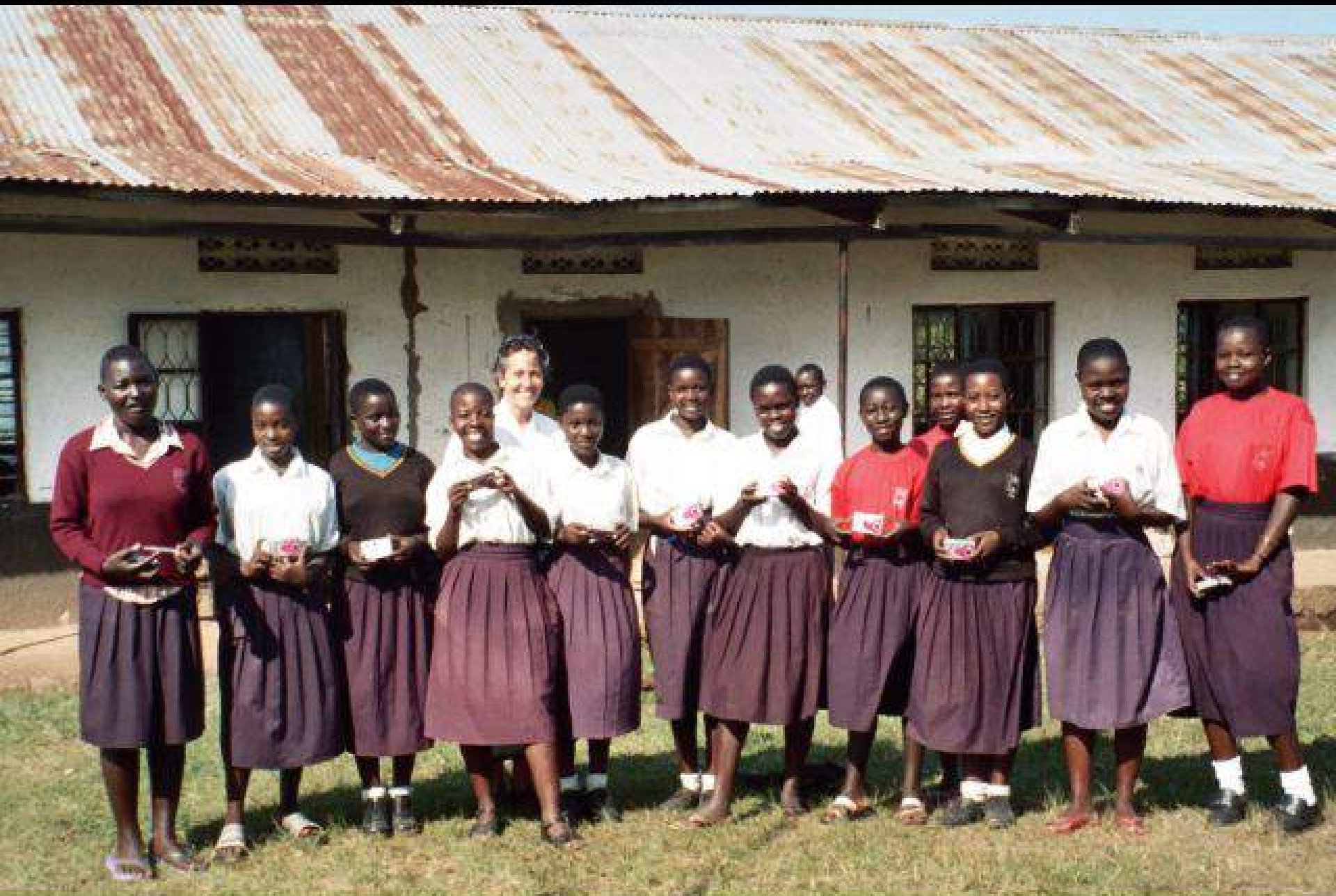
The ZoomUganda girls