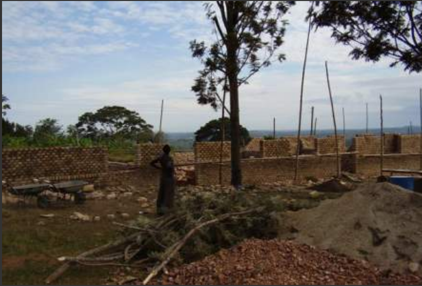
Laboratory Construction, Dec 2007