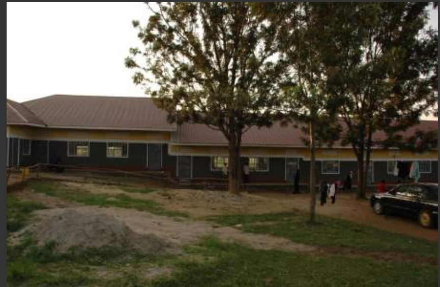
Laboratory Aug 2008