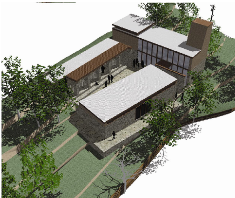
Design of the Nyaya Health Telemedicine and Community Center

Our volunteer network of dedicated students, activists, and technical consultants continues to inject the ideas and support required to rapidly and effectively roll-out services. Our working groups connect like-minded individuals to work on a specific project requested by our Achham-based team (for example, malnutrition, indoor air pollution, or telemedicine). Our telemedicine team, for example, recently won first prize in the Yale Entrepreneurial Society's business plan competition. We were awarded the Open Architecture Network's grand prize for Asia, which has opened us to a large pool of designers, architects, and engineers. One of the design teams, Max Fordham, LLP, will be coming to Achham to build a telemedicine and community center, where people from the district will be able to access Internet-based educational activities, and where we will be able to interface with international physicians for radiology, pathology and similar telemedicine services.