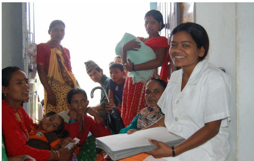
Nyaya Health midwife performing intake