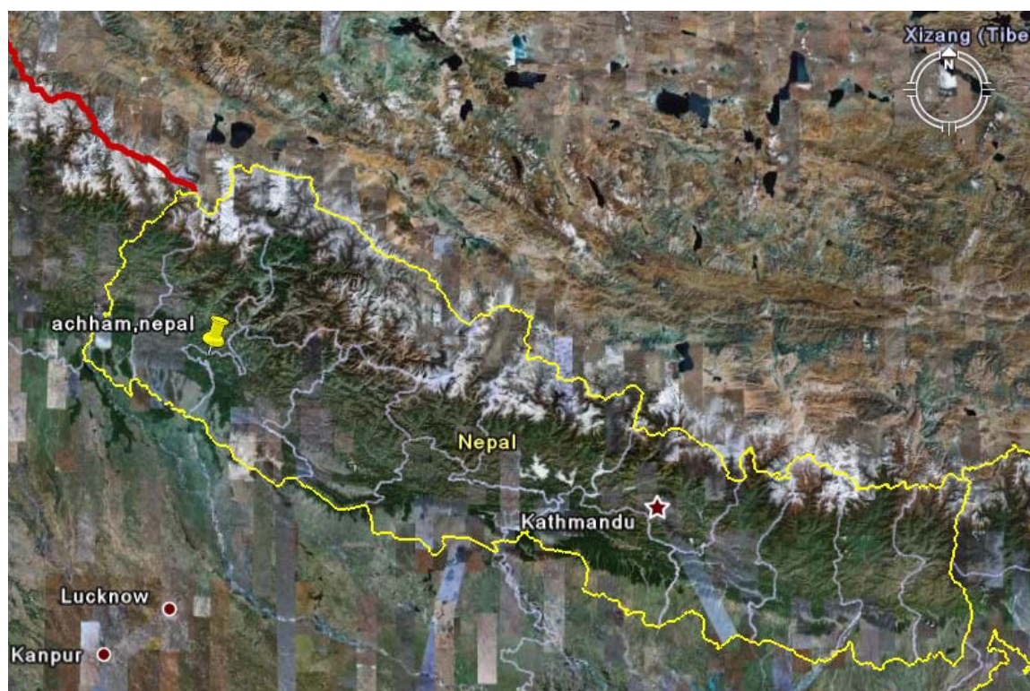
Map of Nepal, displaying the location of Achham

Given the underdeveloped roads, the average transportation time to Sanfe Bagar is approximately two hours by foot for most patients, though many patients must travel 4 hours or more. This is not because our clinical sites are located in an out-of-the-way location, but rather because of the nature of the remote, hilly geography with poor transportation infrastructure. The clinical sites are actually in the largest transportation hub for the region, making them more accessible than other locations. Though most persons are accustomed to long walking distances, community healthcare workers (CHWs) are being trained and equipped with communications technology by Nyaya Health to develop an effective triage and mobile home-based service system. The hospital at Bayalpata faces similar transportation challenges that can be feasibly and effectively addressed through a community-based strategy employing CHWs to facilitate patients' arrival for surgical procedures or inpatient referrals from the clinic.