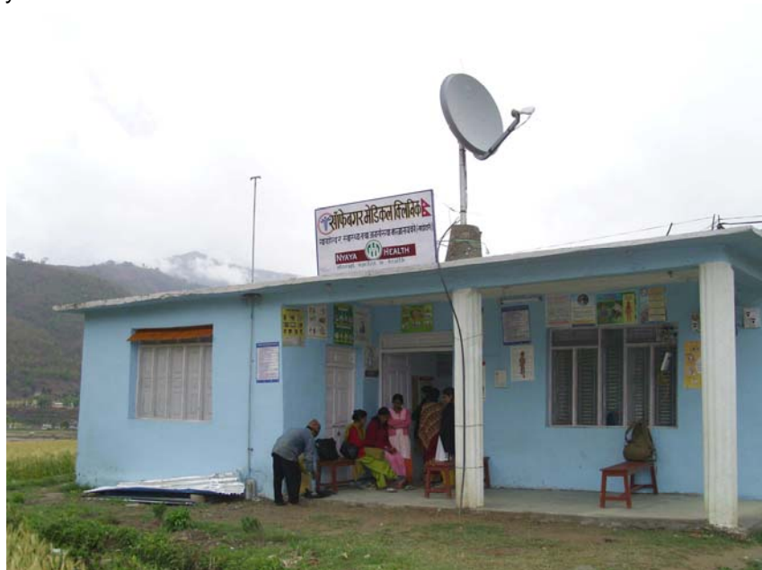
Nyaya Health Sanfe Bagar Clinic

The heart of Nyaya Health activities in Achham is a four-bed, five-room clinic focusing on primary care, maternal and child health, HIV, and tuberculosis. Our clinic is run by an all-Nepali staff consisting of a physician, community healthcare workers, midwives, lab technicians, and project managers. We are expanding a network of community health workers who provide essential outreach and triage services to our geographically dispersed population. These services have been developed in collaboration with the government of Nepal; our ultimate goal is full integration of our services with the developing public-sector health program. Over the next year, we are constructing a community telemedicine center, applying information and communication technologies in innovative ways to improve the effectiveness and equity of our health services. We are developing innovative management programs to improve our community ownership, accountability and responsiveness. Additionally, we are exploring mechanisms of sustainable, accountable financing through microfinance and community-based insurance . Our long-term vision is to work with local communities as part of a global healthcare movement that: (1) facilitates resource distribution to resource-denied areas; (2) fosters grassroots collective action; (3) involves the central government in pro-poor health infrastructure; and (4) achieves transparency and collaboration in global health delivery.