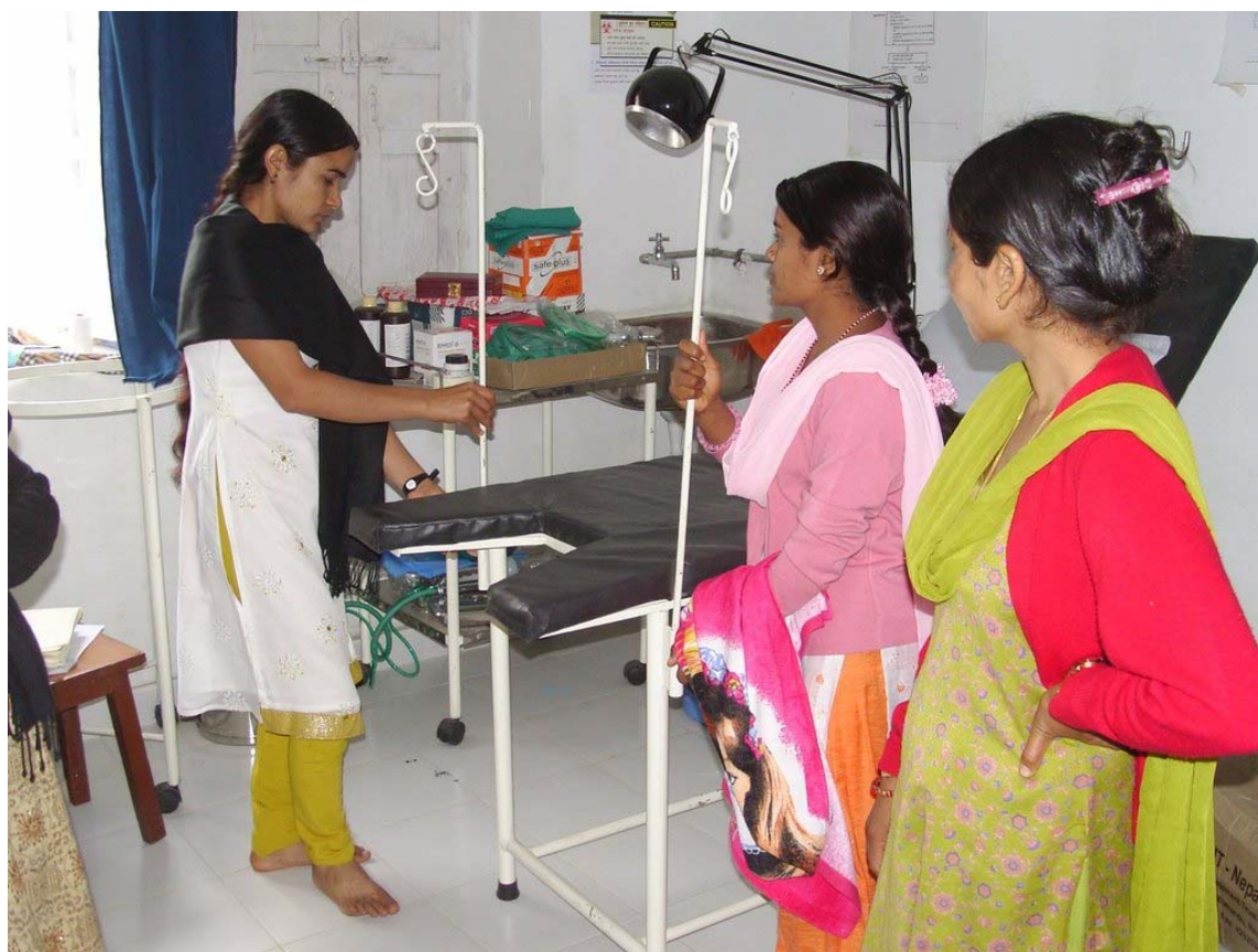
Sanfe Bagar Medical Clinic Delivery Suite

Presently, the Sanfe Bagar clinic treats just over 60 patients per day, and is quickly reaching its capacity. The healthcare problems of the region are severe, with the patients we see typically in dire need of health services. Community members, government officials, clinic staff, and patients are all advocating that we rapidly, efficiently, and effectively expand our high-quality services to include inpatient and surgical capacity, given the extensive need in the area.