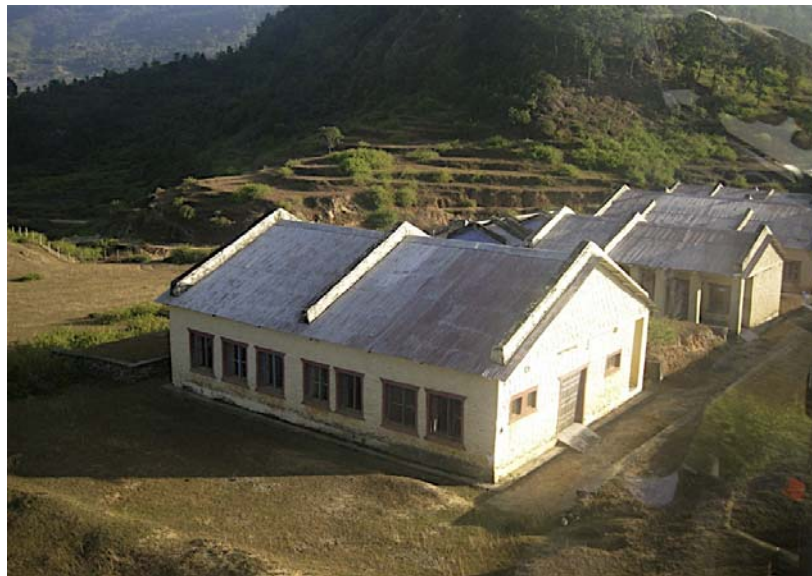
View of the Abandoned Bayalpata Hospital Complex

To achieve our objectives, we have created a step-wise plan of implementation and assigned project directors to oversee these steps. We have detailed the protocols and procedures that will be followed during the construction and expansion of services, produced contingency plans in the event of potential obstacles, and crafted an efficient but comprehensive budget for this initiative.