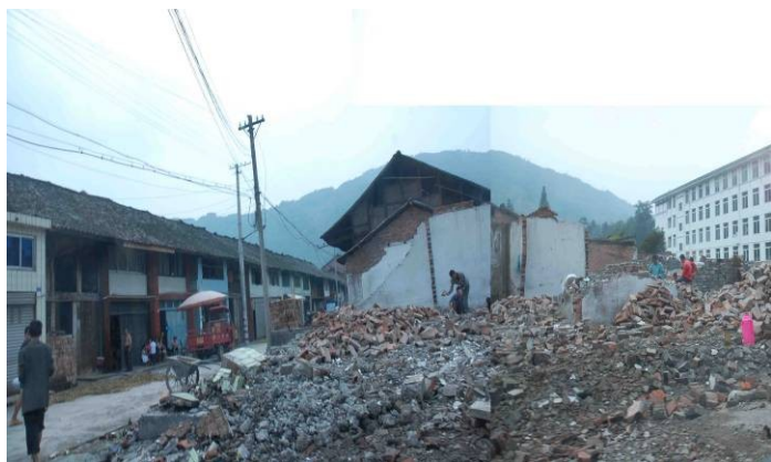
Another academic building was destroyed and now is an empty area.