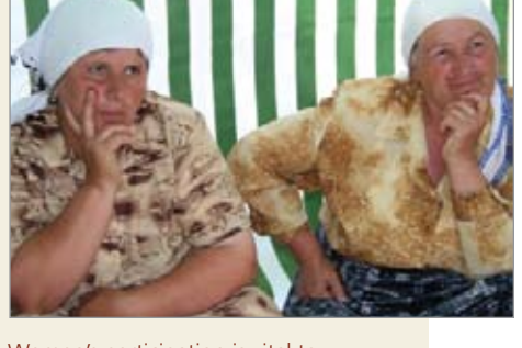
Women's participation is vital to Kosovo's future

On the question of Kosovo's current status, 54.3% of respondents express dissatisfaction with the situation as it stands now. But the lack of employment, not the surplus of political uncertainty, is their chief complaint. More than twice as many women cite unemployment as the reason for their dissatisfaction as those who cite uncertainty over Kosovo's status. Other top reasons include general economic problems, poverty and low salaries or pensions.