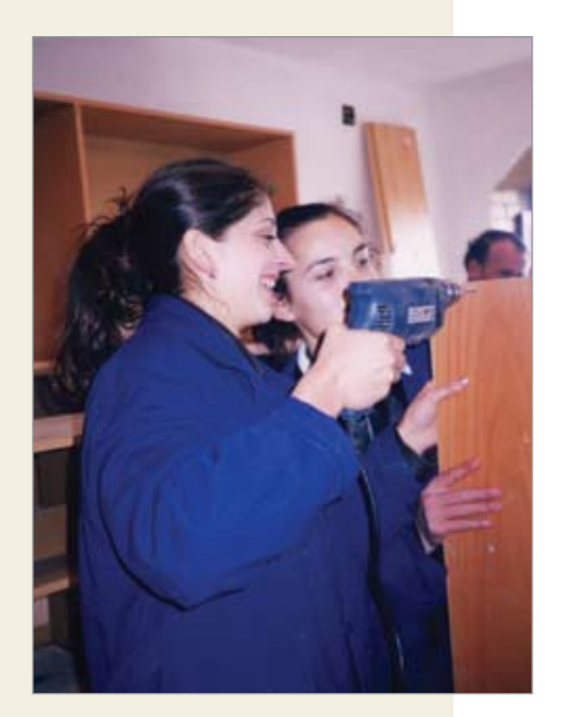
Non-traditional skills trainings help women challenge gender stereotypes

Unemployment rates for women are estimated at 60%, and combined with the lack of childcare, some sources estimate that women account for only 10% of the workforce.<sup>59</sup>