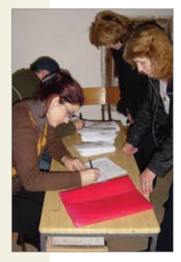
Starting the journey from crisis to self-sufficiency

his report combines grassroots access and experience with international political expertise to amplify women's voices in the ongoing discussions about Kosovo's future. It is the result of a partnership between Women for Women International, the Public International Law & Policy Group (PILPG) and American University.