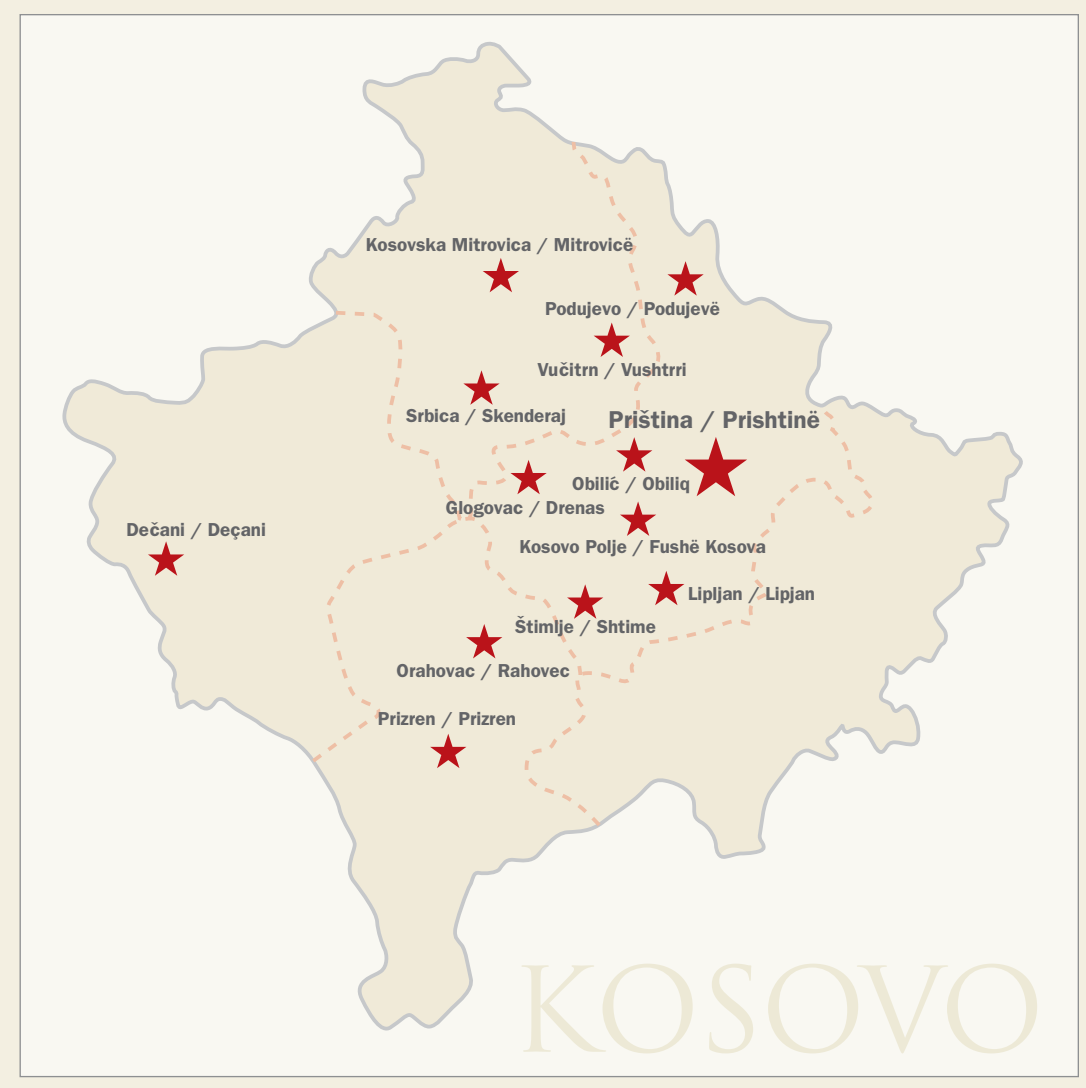
Women for Women International-Kosovo works in the communities indicated above. The first spelling is Serbian, the second spelling is Albanian.