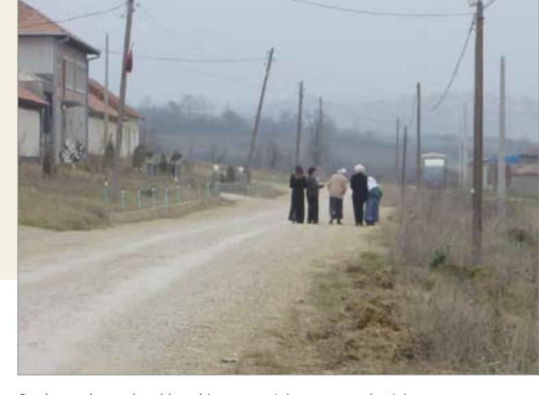
On the road to active citizenship, women's issues are society's issues

Kosovo's final status remains unresolved to this day. But one thing is certain: For long-term peace and stability to succeed in Kosovo, grassroots women's priorities and recommendations must be part of Kosovo's national agenda. However, most of the people engaged in this conversation are men acting in their professional capacities as diplomats, government officials and advisors, with very few women speaking on behalf of anyone or anything. Women are simply not at the negotiating table.