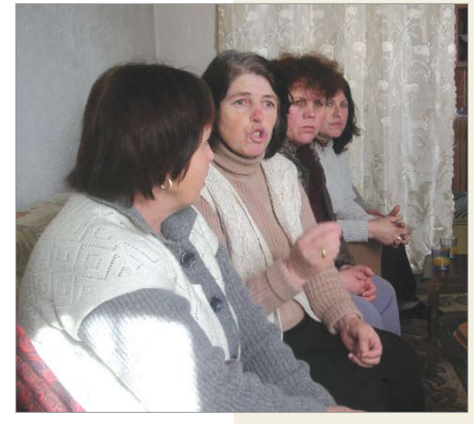
When women are engaged, all of society benefits

Reconstruction is a marathon, not a sprint. Kosovo desperately needs long-term investment in its social and economic infrastructure to address people's needs and help them acquire the tools to move forward. Schools need the resources to help students become members of a skilled work force. The economic sector must be accessible to women and acknowledge the obstacles to their success by offering adult vocational skills trainings, work-study opportunities and placements, access to credit, and market-based business development services.