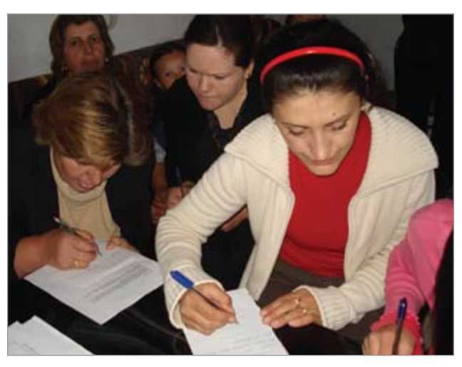
Women write letters to their sponsors in the United States and other countries around the world

20.5% say they trust it a great deal. This is particularly interesting, because although the majority of women know they have economic, social and political rights, 71.4% feel their rights are different because they are women, and that it affects their ability to do things such as leave the house, attend school, vote and run for office. This discrepancy points to the possibility that even if women's rights exist on paper, customs and tradition may restrict those rights in practice.