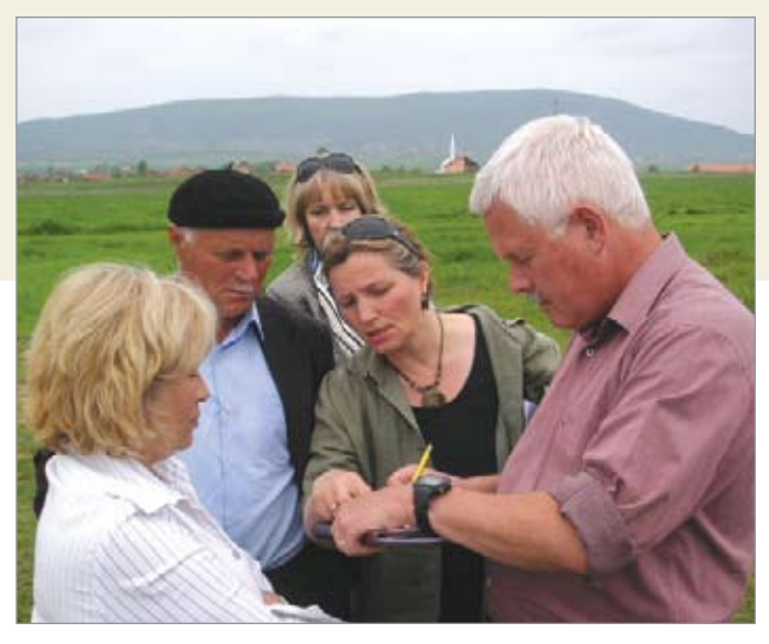
Women for Women International helps women create sustainable agribusinesses in Kosovo

According to the Acting Ombudsperson, awareness of these documents "within the central and local levels of government, the courts and among the wider public is quite poor. This is mostly due to the fact that the texts of these instruments are not made available to the public, and are difficult for persons working in the public administration to find, particularly in the Albanian and Serbian languages." The result is that "there is a general lack of knowledge on what discrimination actually is and how to combat it." This combined with the "weak administrative, executive and judicial