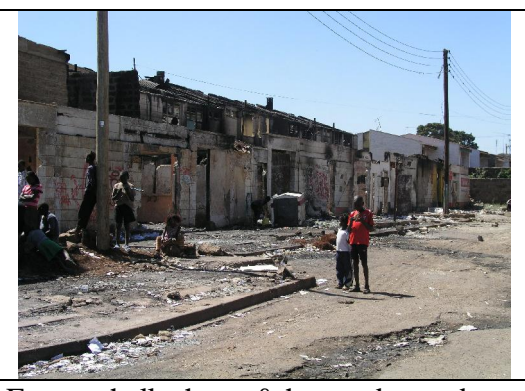
Empty shell: shops & homes burnt down