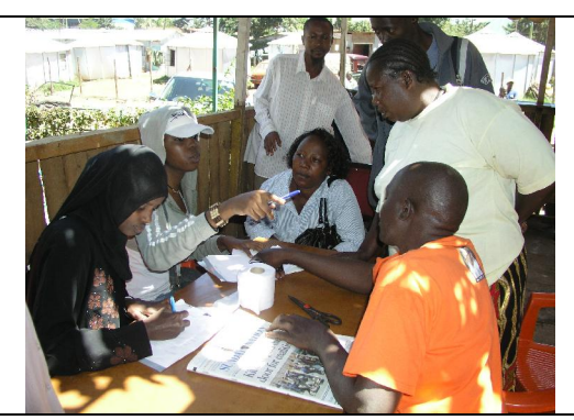
People arrive for treatment