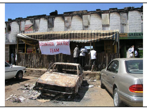
We set up medical camp in Sarang'me