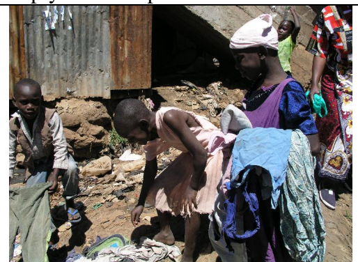
Children sifting through abandoned clothes