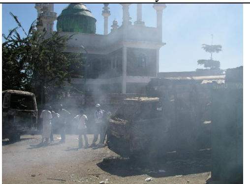
Public vehicles were not spared the wrath