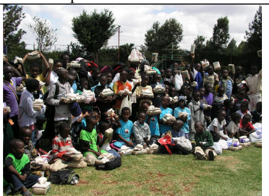
Children receive food and clothes from friends of Sadili Oval