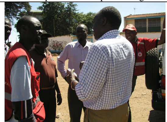
Mr. Odera discusses with Red Cross officials, village leaders, and the Chief for Sarang'ombe the best possible way for food to reach the most needy