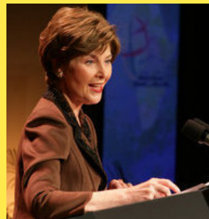
First Lady Laura Bush