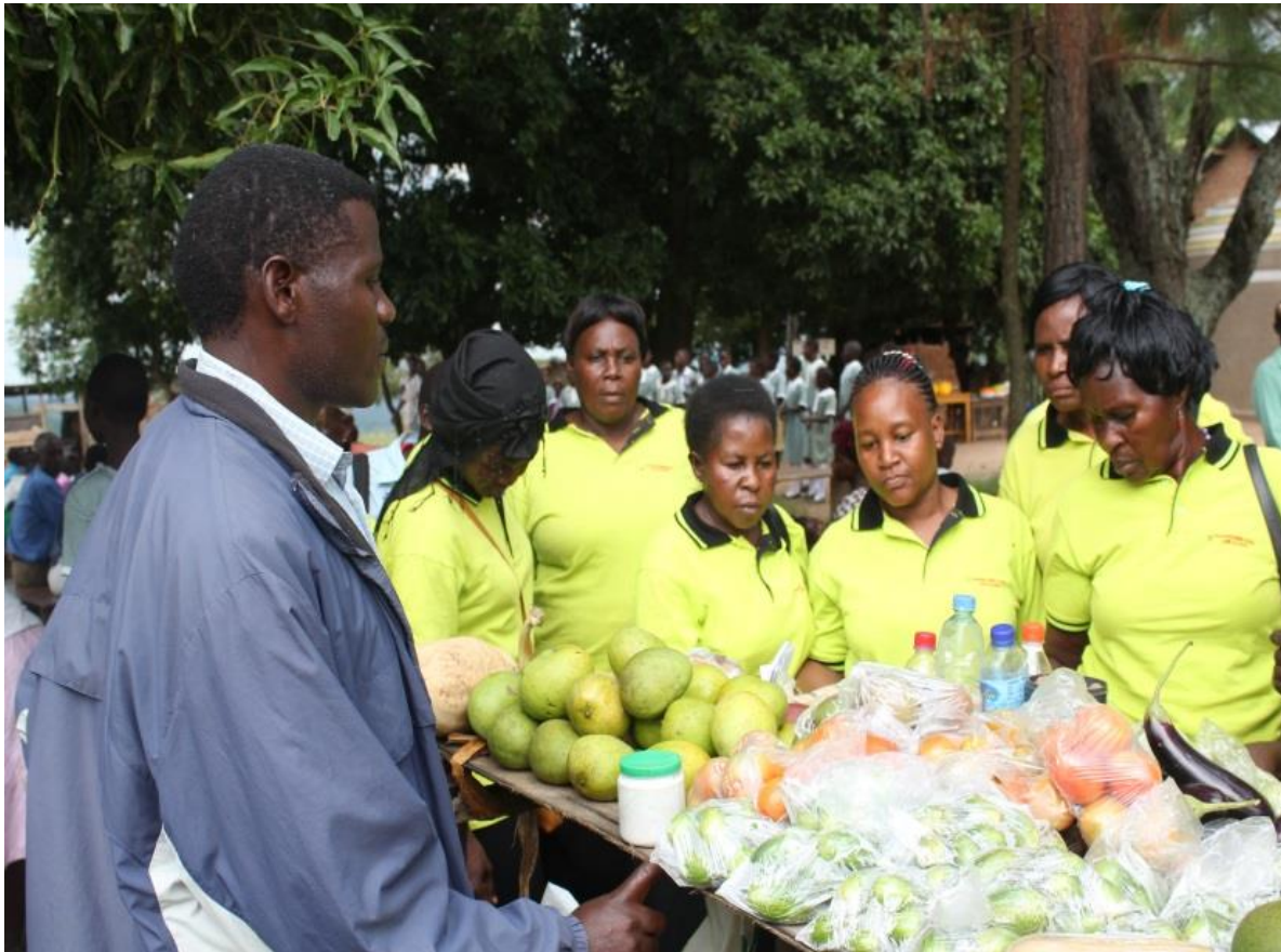
Figure 4: A farmer displays his agricultural products during an exhibition

From the field, and after a brief rest and entertainment, the CSO leaders, community members and other invited guests toured the exhibition and other projects at KEA headquarters to see what farmers and the local people and members of KEA do.