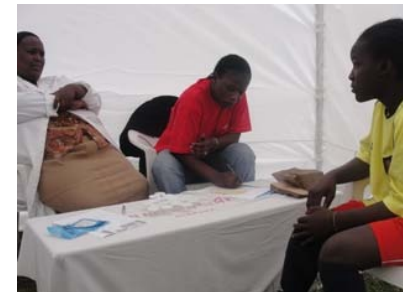
TB screening by AAR