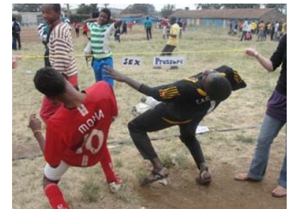
Off-field HIV/AIDS activity.