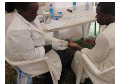
VCT by FHOK