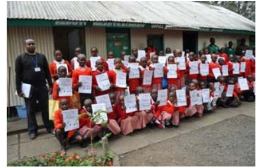
G-Pange Skillz graduates, Nazareth School

A total of 3000 student participants from different schools and community centers have so far graduated from the G-pange Skillz HIV/AIDS awareness program. These students have been provided with potential life-saving information and skills to live HIV-free. They have been empowered to conduct peer education activities within community, and to reach out to more others through formal and informal sessions.