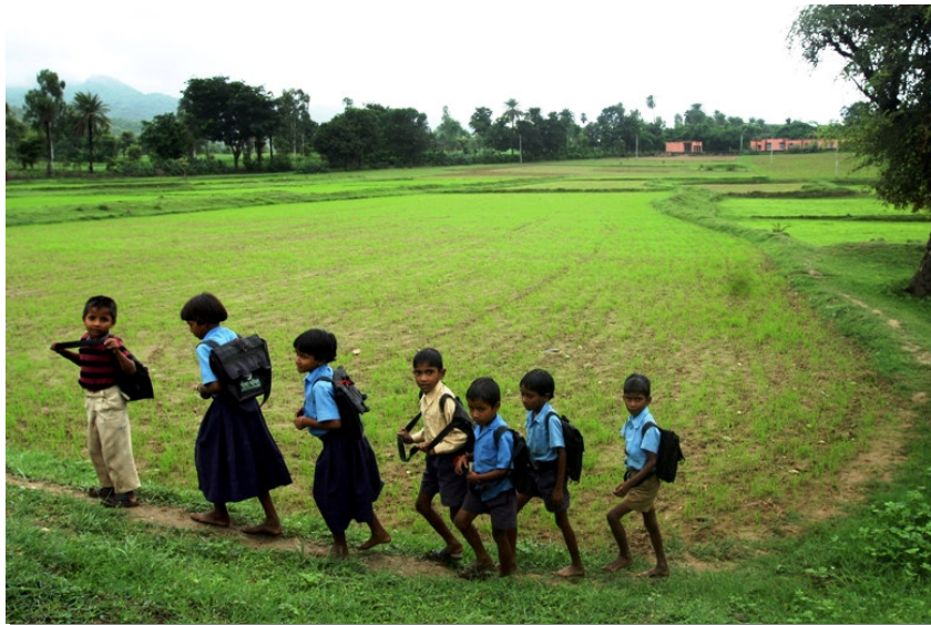
Seva Mandir, Udaipur, Rajasthan