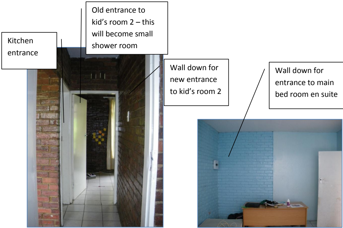
Old View from Kid's room 1