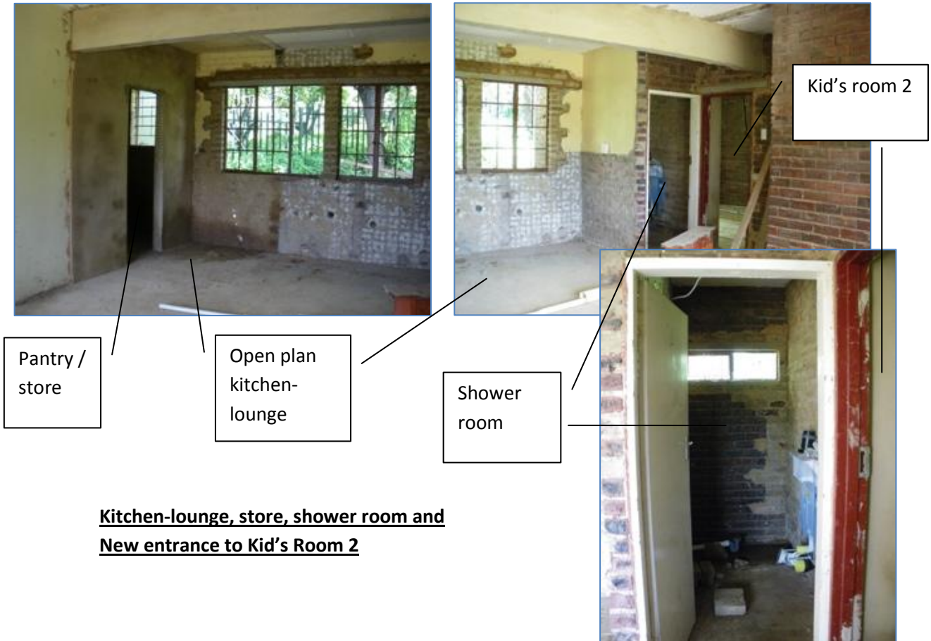
Kitchen-lounge, store, shower room and New entrance to Kid's Room 2