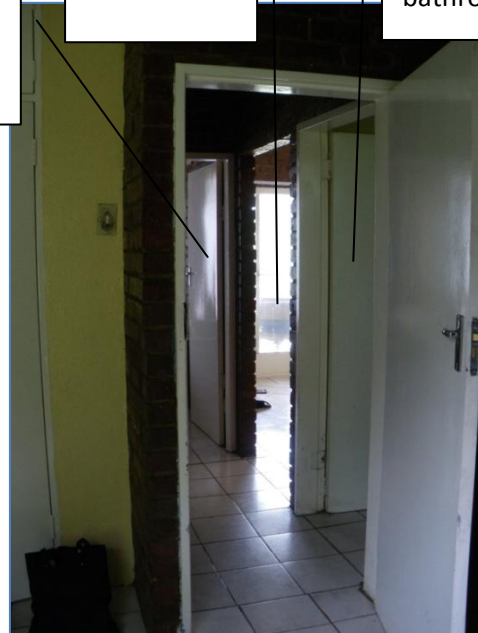
Old lounge area