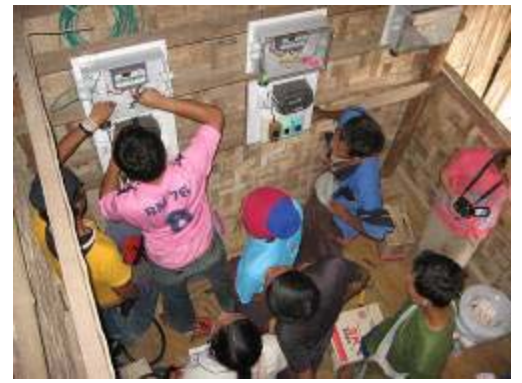
Medics work on the charge controllers and inverters in the equipment room

The training lasted two weeks, starting on December 3<sup>rd</sup>, 2007. This included trainings in theory, installation, and maintenance and concluded in each case with the installation of the systems.