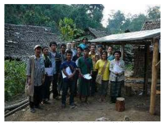
Group picture after the training and installation at ETT Camp

Also – an NGO who does a lot of medical work in the area has decided to initiate a training in immunization to be held at ETT in January of 2008. They will base their training on the vaccine refrigerators we installed at ETT and DPN, and they will provide the vaccines necessary for the program to take place.