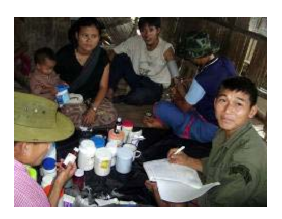
Senior FBR medic supervises trainees on IDP Clinic