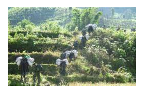
FBR Relief Teams Heading Out