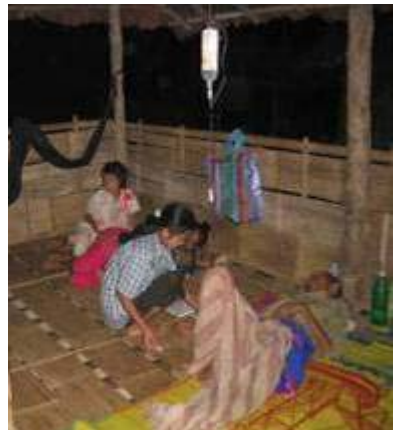
Patient receives care under solar lights

Eastern Burma, along the border with Thailand, is a zone that has been under siege for the past several decades. The Burmese military has been burning villages, raping women, forcing people into slavery and killing the indigenous people of the area. In the past, it was sometimes possible to escape to refugee camps on the Thai side of the border.