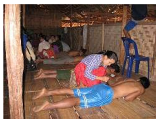
Over 200 patients received acupuncture treatment during the training