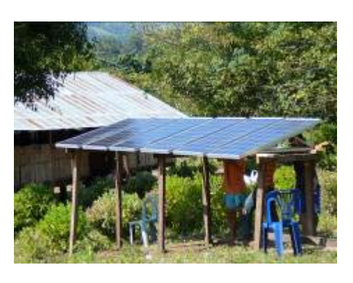
Solar Panels at DPN Hospital