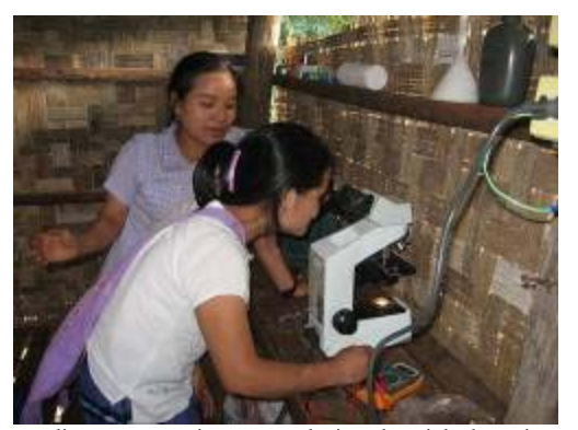
Medics can use microscope during the night by using the power from the installed solar systems.