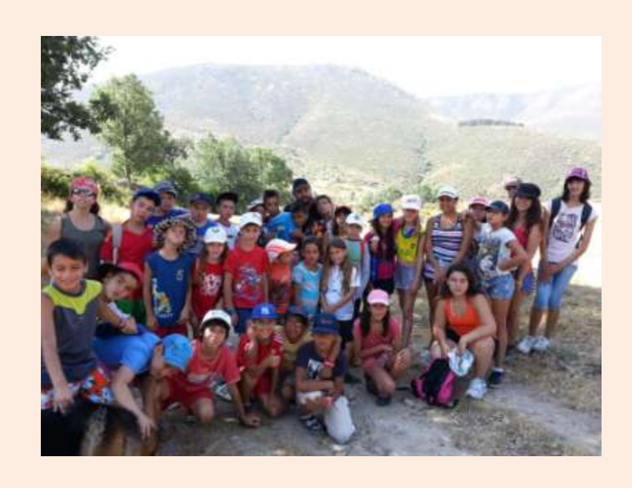
ASOCIACIÓN JUVENIL ATZ