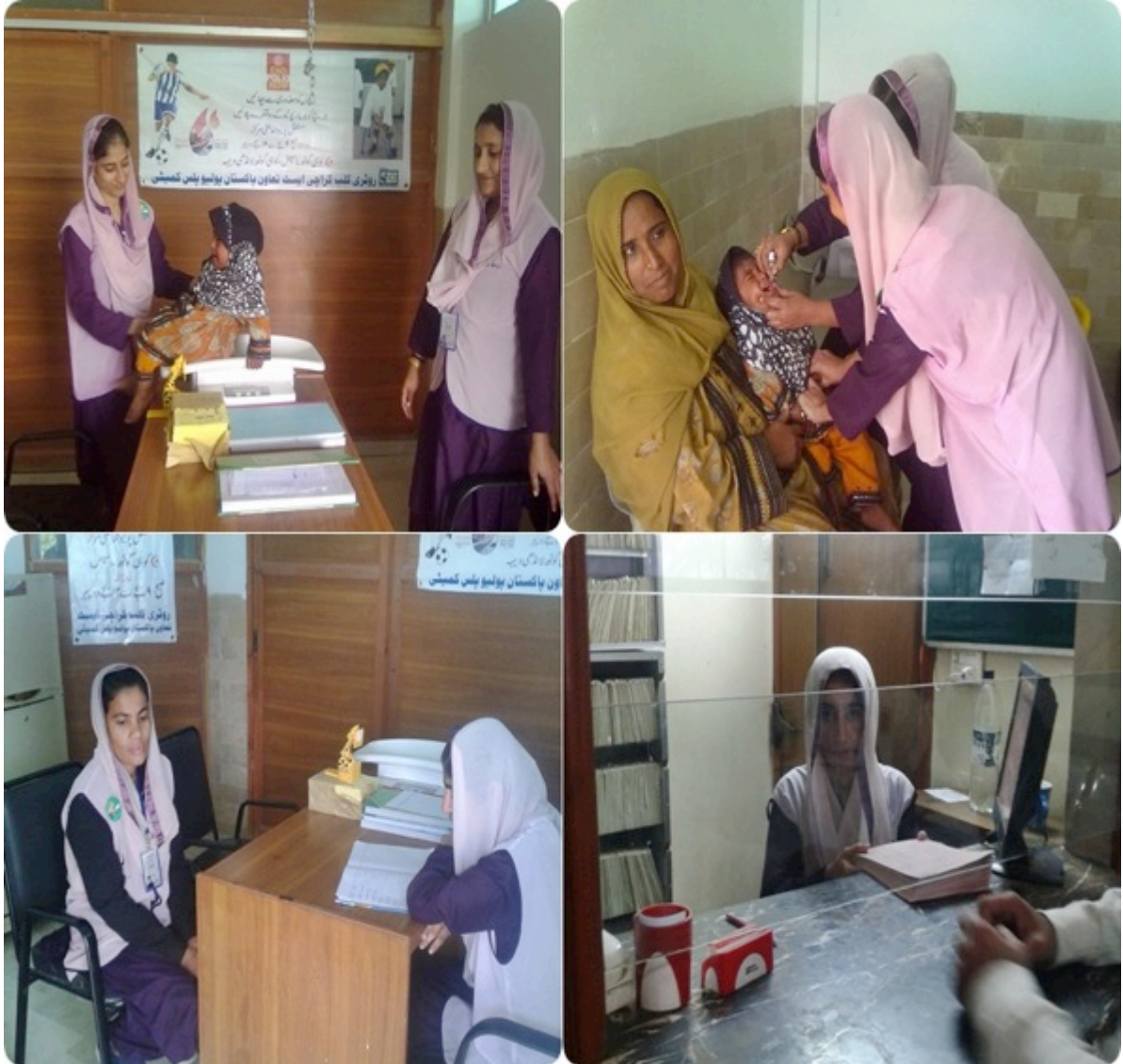
Figure 8 Students in vaccination center and antenatal clinics

The nurse aids rotated in the vaccination centre and antenatal clinics and learn how to administer vaccines and maintain cards for antenatal check ups.