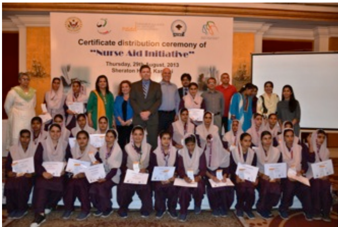
Figure 18 Group photo of Nurse Aids, RAAD, AZIMS, US Consulate staff with US Consul General