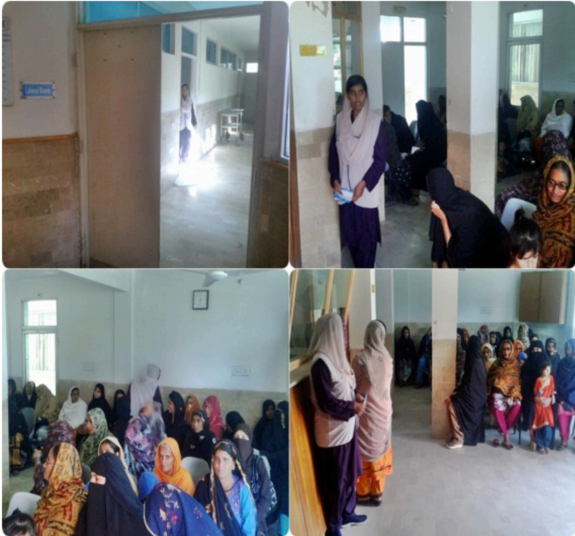
Figure 12 Students rotating in OPD