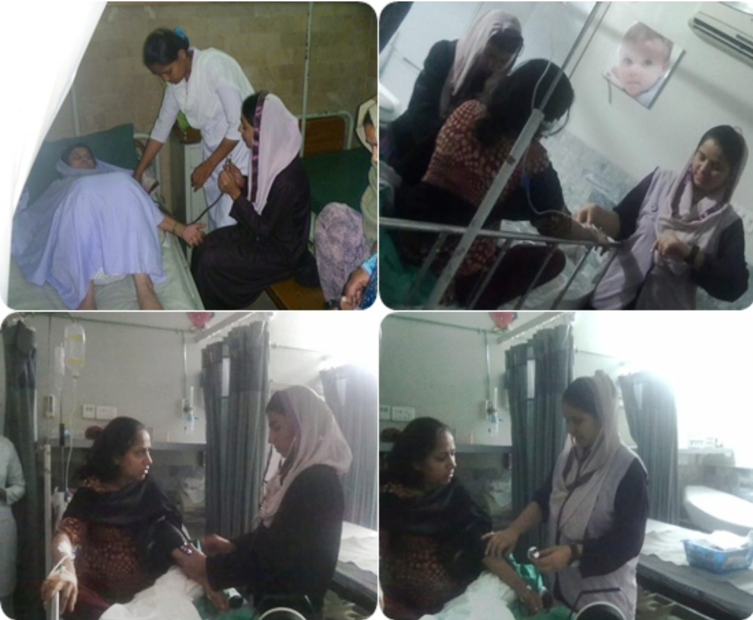
Figure 7 Students taking vitals for patients in clinics

The term "vital signs" usually refers to the patient's temperature, pulse, breathing, and blood pressure, as these reflect the patient's condition. We trained the candidates how to take the vitals of patients individually.