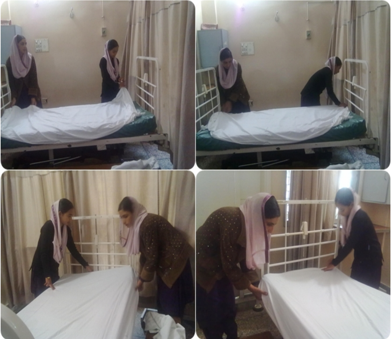
Figure 9 Students performing bedding and linen handling

Bedding and linen handling is an important task for nurse aid. All students were provided training on how to handle linen, maintain cleanliness of beds and put on bed sheets. They performed these tasks in an actual hospital environment.