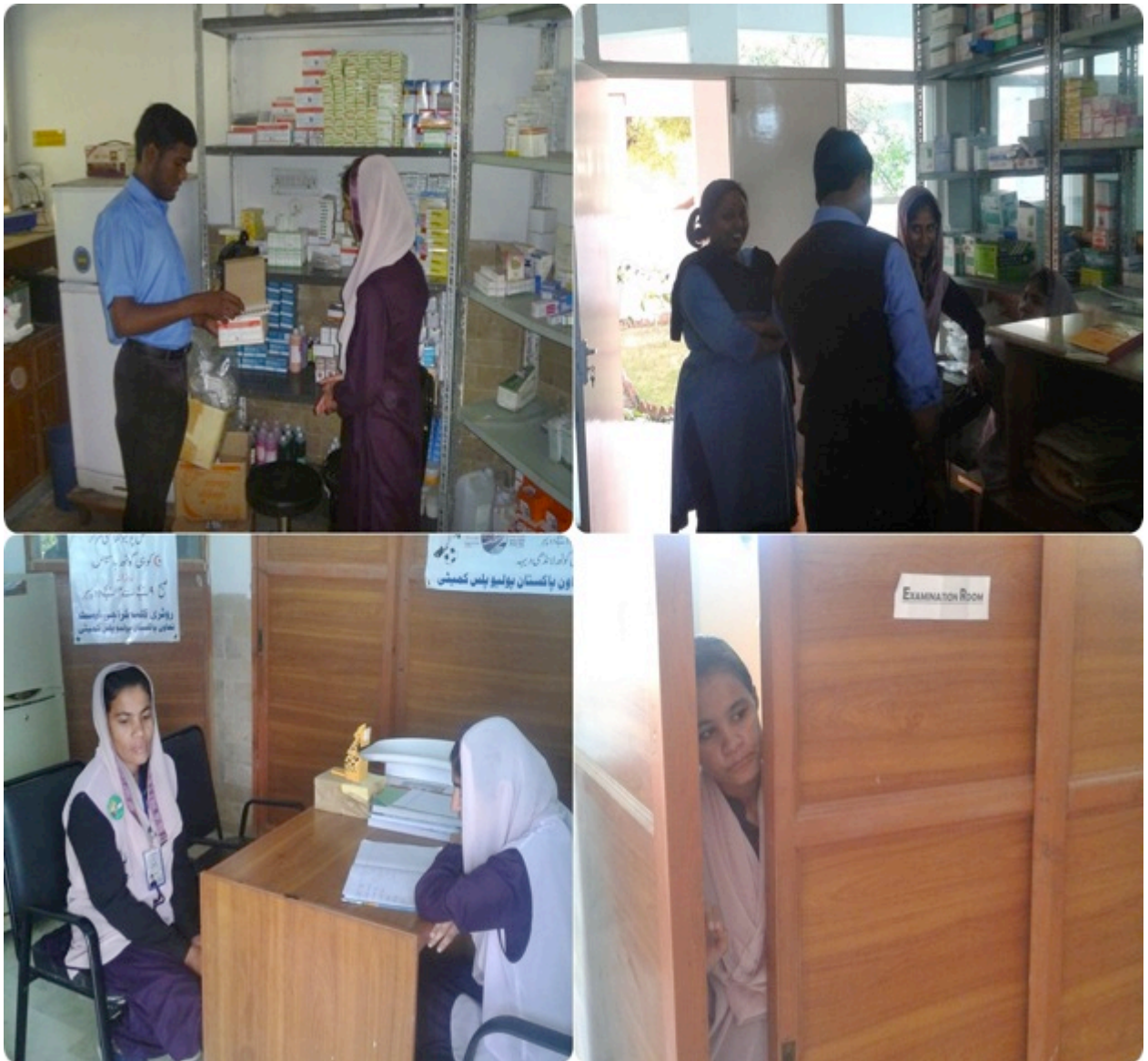
Figure 13 Students rotating in vaccination center, examination room