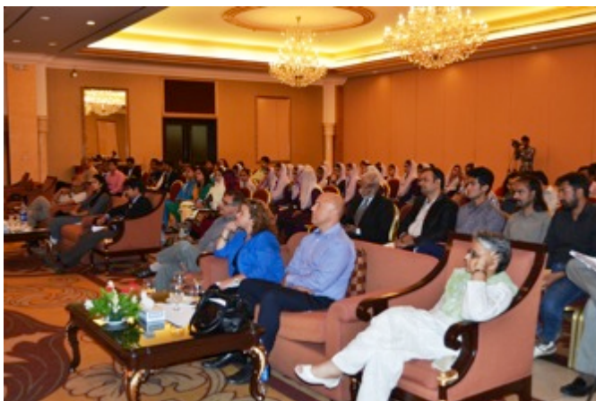
Figure 19 Audience at closing ceremony including NGOs, hospital representatives, US consulate staff and US alumni