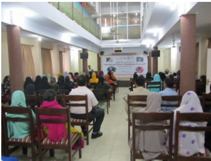
Figure 4 Participants, their families and village leaders attending inauguration