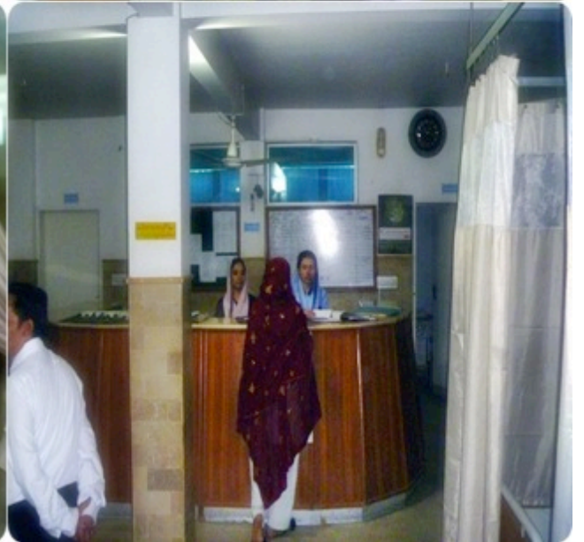
Figure 14 Students rotating in wards