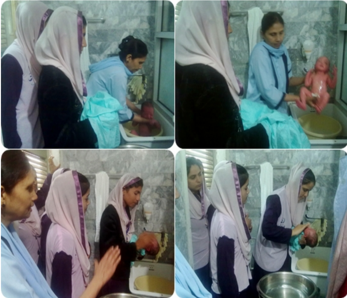
Figure 10 Students giving baby bath

Students were trained on how to give the baby a bath by following proper guidelines.