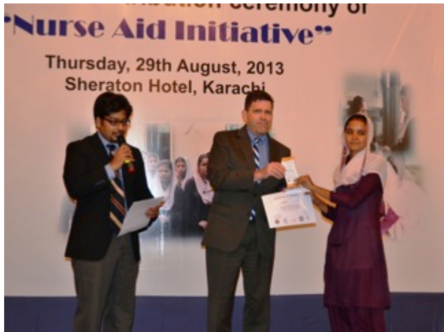
Figure 17 Nurse Aids receiving certificates from US Consul General