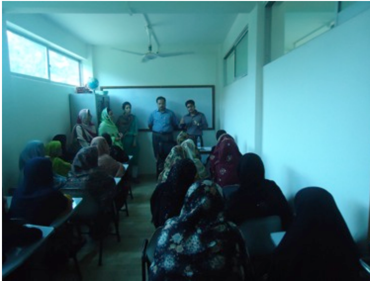
Figure 2 Orientation session for participants