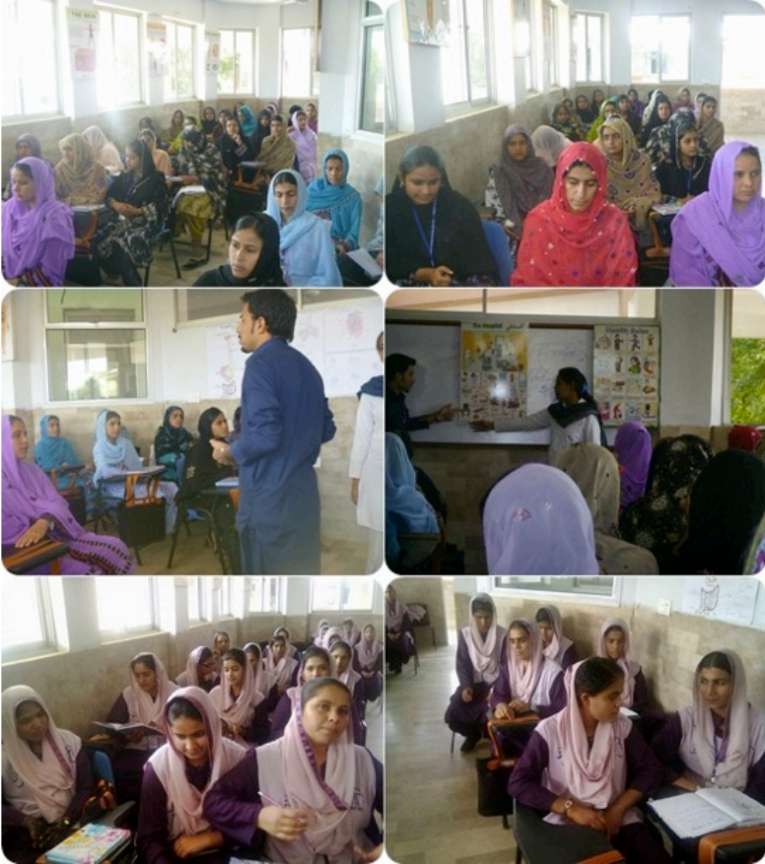
Figure 5 A typical classroom session