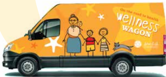
The Wellness Wagon "on the road to health"

Improved health and wellbeing of children.