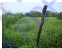
Reclaimed grass field

The whole of Marigat District is a semi-arid area that experiences dry spell occasioned by short erratic rains that hardly meets crop production needs of the community. This has been compounded further by global warming that has rendered the area vulnerable to recurrent droughts that wipe all livelihood dependencies. The organization has build the capacity of the locals in initiating environmental conservation techniques that has yielded improved livestock production. In liaison with government extension personnel, farmers have been facilitated to reclaim over 60 acres denuded lands to enhance pasture production.