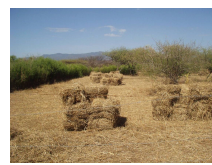
Harvested bailed hay