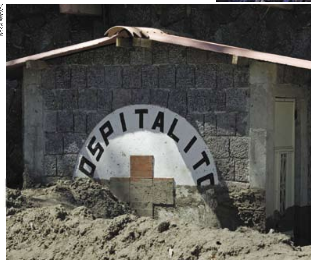
The mudslides caused by Hurricane Stan damaged infrastructure and destroyed homes and crops throughout the Lake Atitlán watershed.