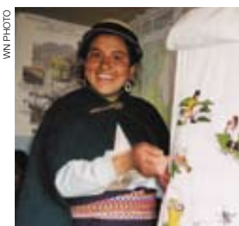
A CEMOPLAF health worker in Ecuador uses simple visual images to explain how diseases can be transmitted and what preventive steps can be employed.

The Medical Center for Orientation and Family Planning (CEMOPLAF), Ecuador, was