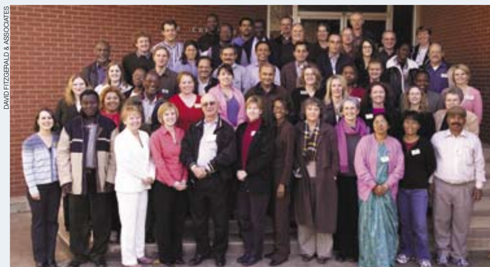
The entire World Neighbors staff team during the 2005 Global Conference Inspiring People, Strengthening Communities: Moving Forward Together.

For the first time in six years, World Neighbors staff members from around the globe were in the Oklahoma City area during Inspiring People – Strengthening Communities: Moving Forward Together, a World Neighbors global conference, this past November. Held at the Oklahoma Center for Continuing Education on the University of Oklahoma campus in Norman, the conference was both a chance for international and domestic staff to interact, and a catalyst for a strengthened team approach and deepened understanding of all World Neighbors goals. World Neighbors has a domestic staff of 35 and 145 staff stationed in its program areas in Asia, Africa and Latin America. For many, this was the first time they had visited Oklahoma City headquarters or been to the United States.