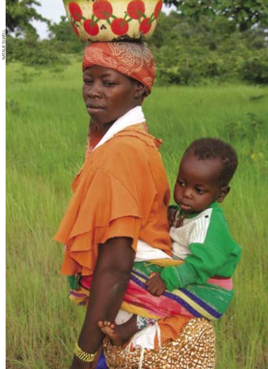
Throughout Asia, Africa and Latin America, the World Neighbors WOW! program is working to improve the lives of women and their families, such as this Burkina Faso mother and child, through integrated programs. For more information, see page 30.