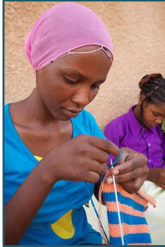
(At L) Teneflit working on a knit hat to protect a baby from the desert cold season temperatures that can leave frost on the ground in the early mornings.