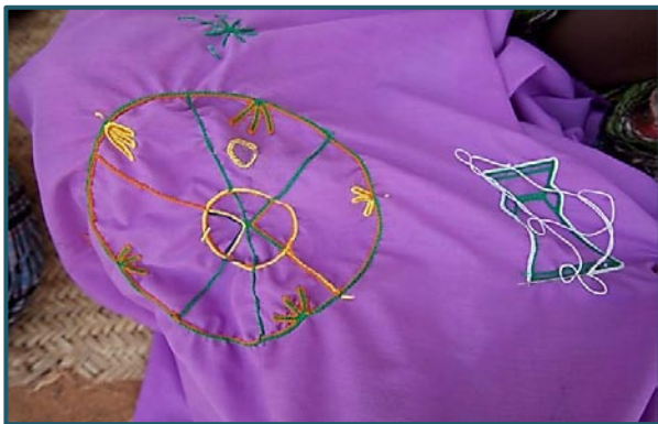
Dafada's central design.