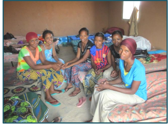
Girls in their dorm.