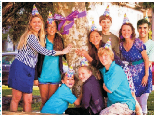
All four generations of youth leaders celebrated TREE MUSKETEERS' 25 th anniversary and Marcie the Marvelous Tree's birthday.

Thirteen Brownie Girl Scouts sat around the sycamore they'd just planted and named Marcie the Marvelous Tree on May 9, 1987. The third graders dreamed up a plan to help the Earth that became TREE MUSKETEERS – the first known youth environmental organization.