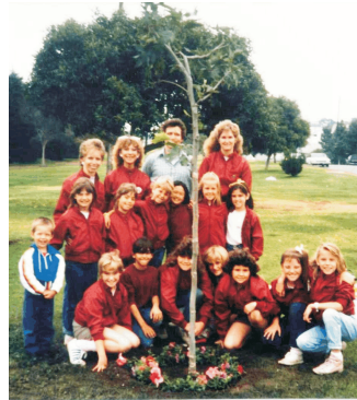
The founders & Marcie the Marvelous Tree

founders to take action. They inspired the #1 producer of ozone-depleting CFCs to replace the chemical and convinced a large CFC user to switch. Other kids joined in the call for action, and today, the ozone layer is healing.