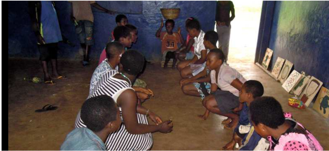
Practicing the Traditional Dance

After the basket making, rehearsing for the closing ceremony continued.