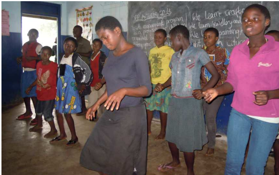
The Senior Group practices the ballet

rhymes at home the previous day. After practicing, the children were made to sing some songs and draw. The day ended at 15.45h.