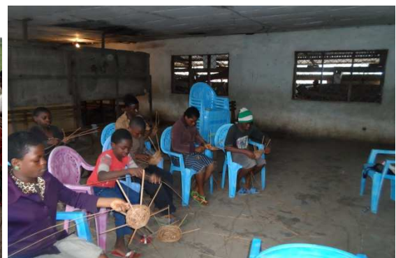
The Senior Group learns how to make baskets

On Thursday the 22 nd August 2013, the youths were being taught how to paint using sand. The first half of