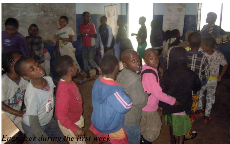
Energizer during the first week

On Friday the 2nd of August 2013, the day began with registration of new participants. Next was an opening prayer, done by one of the children. Energizers and song were shared with the youths. After which was a lesson on personal hygiene presented by the facilitators.