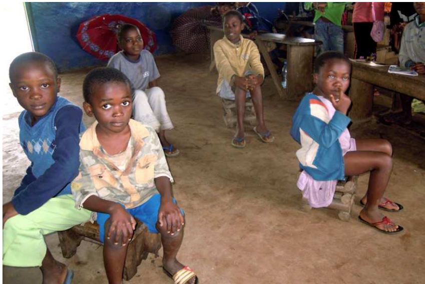
The Junior YEP Participants practice their chair dance

In the office, all the gift bags were put together and labeled with names. The participation certificates for the children in Tole and Bakweri Town were prepared printed. All other necessary preparations were made and authorities were given invitation letters