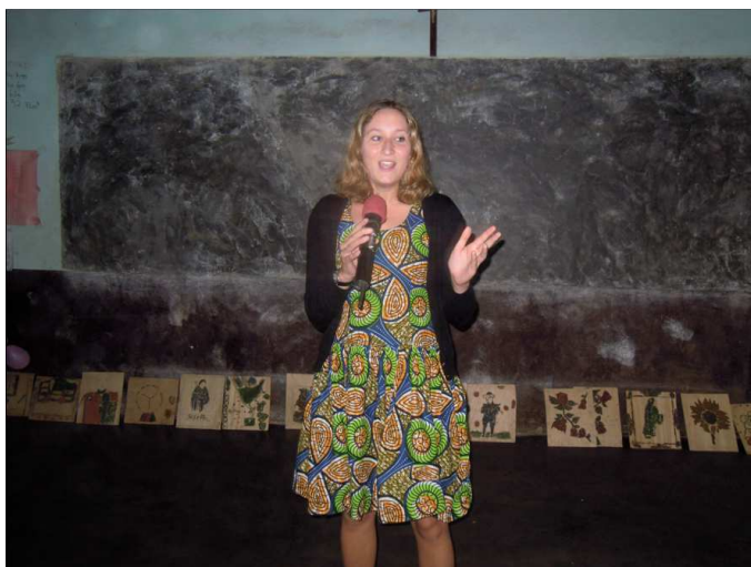
Speech of the international volunteer