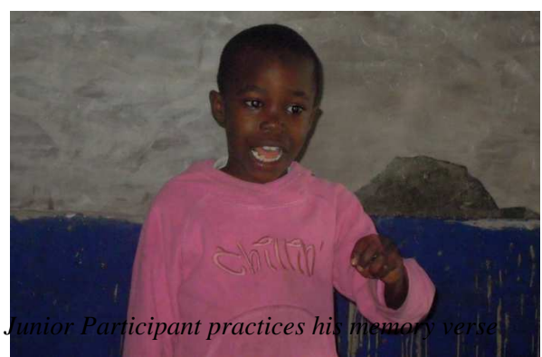
A Junior Participant practices his memory verse

On Thursday the 22 nd August 2013, the youths were being taught how to paint using sand. The first half of