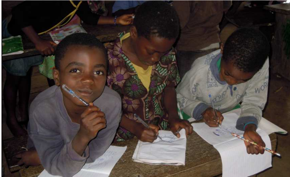
Hard Working Junior YEP Participants

The younger children were too young to understand the difficult stitching techniques. They used the time to sing songs and to do different energizers. An educative story was recounted to them. It was about the bully pig. The day also ended with a word of prayer.