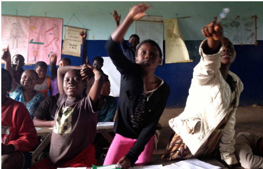
Very enthusiastic participation of the Senior YEP Group.

The participants were taught new songs and thereafter they had another set of word puzzle. The day ended with a prayer. Since Thursday 15 th August was a public holiday, the youths were ask to come only on Friday the 16 th .