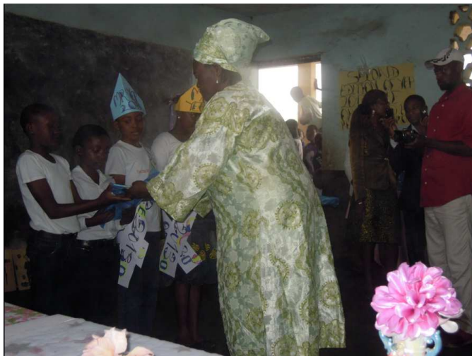
Awarding of gifts