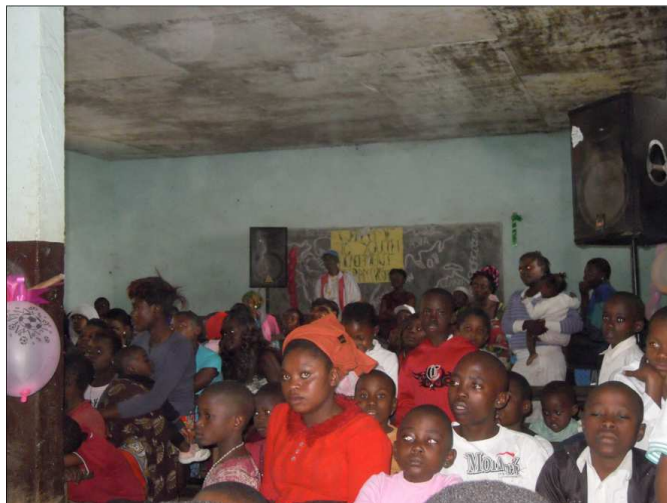
Family and friends of the participants