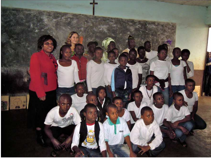
Group Picture of the Senior YEP Participants