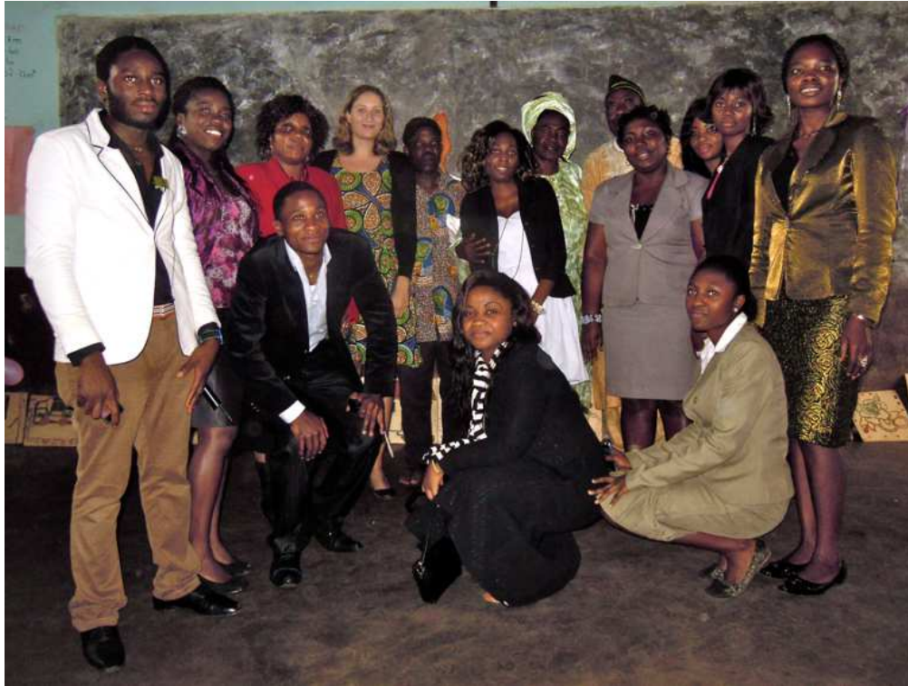
The REO Staff + Authorities. The picture is taken during the Tole Closing Ceremony.