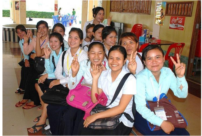
Freshmen GATEways scholars at Meanchey University

Today, Cambodia is only beginning to heal from the scars left by the Khmer Rouge. An entire generation missed out on public education, and today only 2% of women in the country have baccalaureate education. This dearth of professionals is directly linked to infant and maternal mortality, poor education quality, and