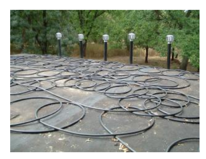
Solar heating coils March 2007

Our thanks to the sponsoring jewelers of the Private Collection of South African Diamond program and the GlobalGiving community, without whose generous support this project would not have been possible.