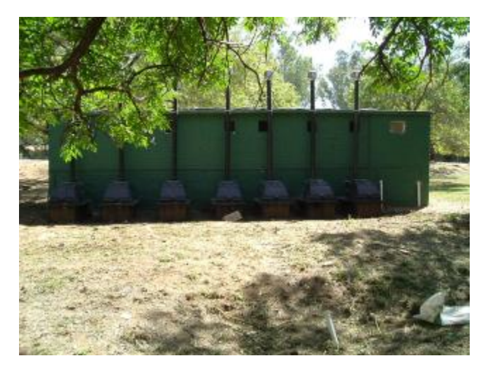
Same building after reconstruction with sanix systems installed May 2007