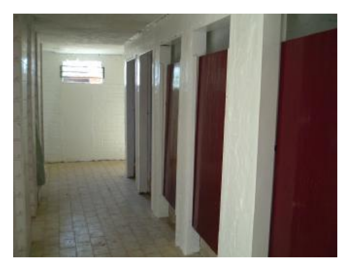
Interior view completed ablution facility May 2007