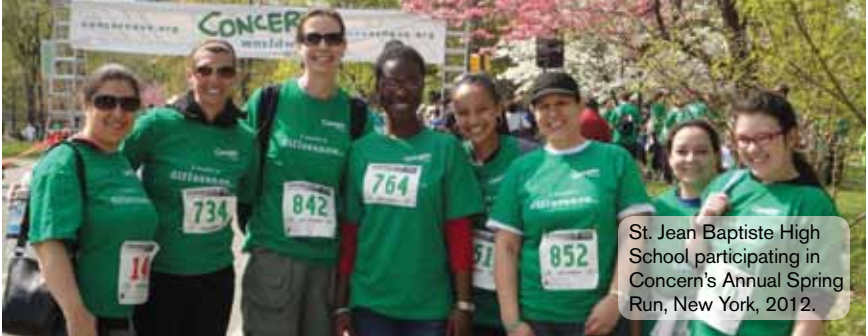
St. Jean Baptiste High School participating in Concern's Annual Spring Run, New York, 2012.

“Global Concerns Classroom brings us one step closer to global solidarity!”