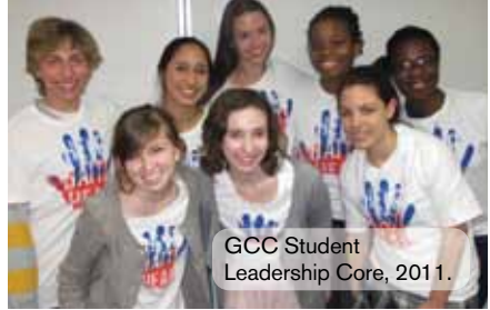
GCC Student Leadership Core, 2011.