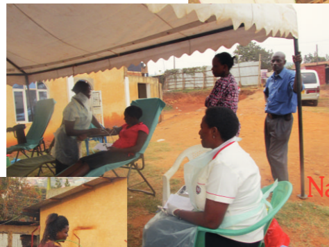
Nakasero Blood Bank