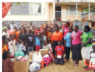
Standard Chartered Bank Ndeeba Branch Visit