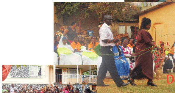
Dep. Mayor & Councilor Makindye Division