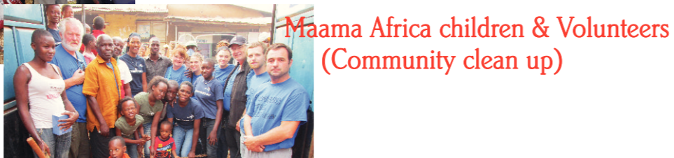
Maama Africa children & Volunteers (Community clean up)