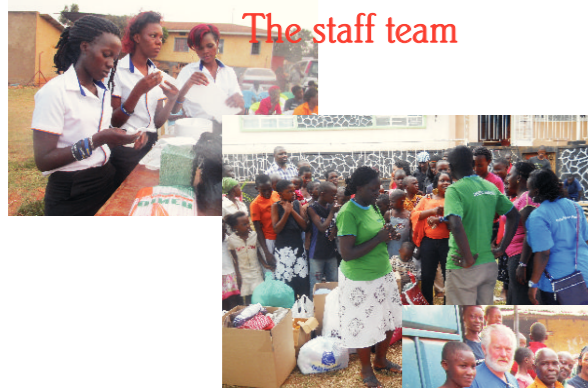
The staff team

Have you ever given back a minute to your community? If you have, thank you!! At Maama Africa we do so annually as pictures speak a thousand words;