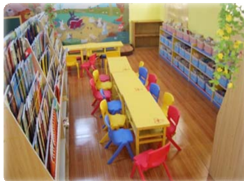
Inviting, cozy, relaxing environment provides a unique experience for rural children to read and learn