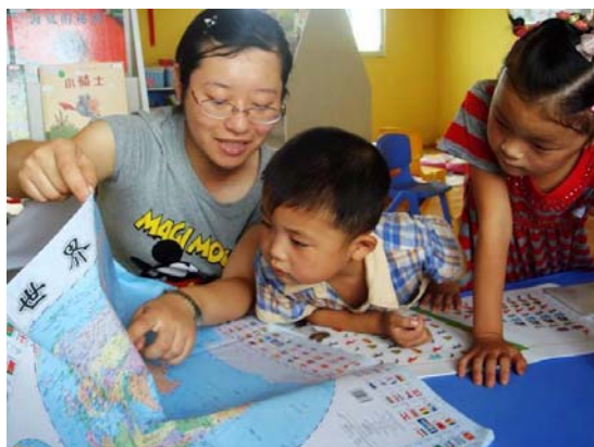
A trained volunteer is guiding students in the “Read a Word, Read the World” enrichment activity

The Dandelion Village Library Program is a low-cost, sustainable and scalable model that follows four principle guidelines: select high quality and developmentally appropriate reading materials, engage students in reading with enrichment activities using library materials, provide ongoing teacher support to integrate library materials into reading instruction, and integrate technologies to foster an online community in rural China.