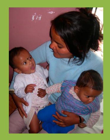
Caregivers are trained in caring for the children as a mother would, providing emotional bonding and developmental support.