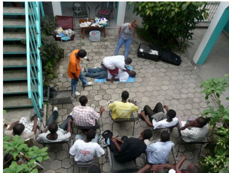
Secondary school students participating in CPR classes