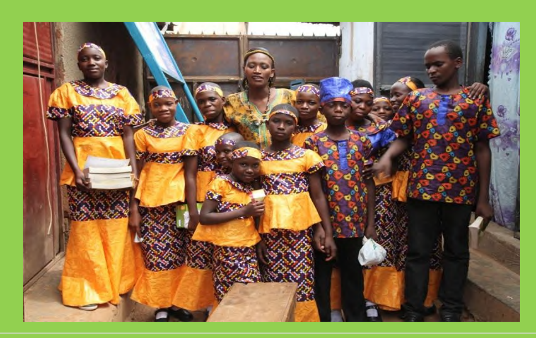
Creating sustainable access to opportunities for sustainability in Kosovo slum & Rural areas of Kampala Uganda. 5 | P a g e