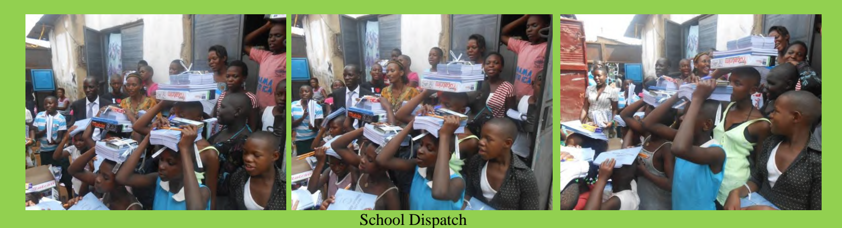
Creating sustainable access to opportunities for sustainability in Kosovo slum & Rural areas of Kampala Uganda. 4 | P a g e

The money received through Global Giving was also used for scholastic materials such as pens, books and paper for this first school term in 2013.