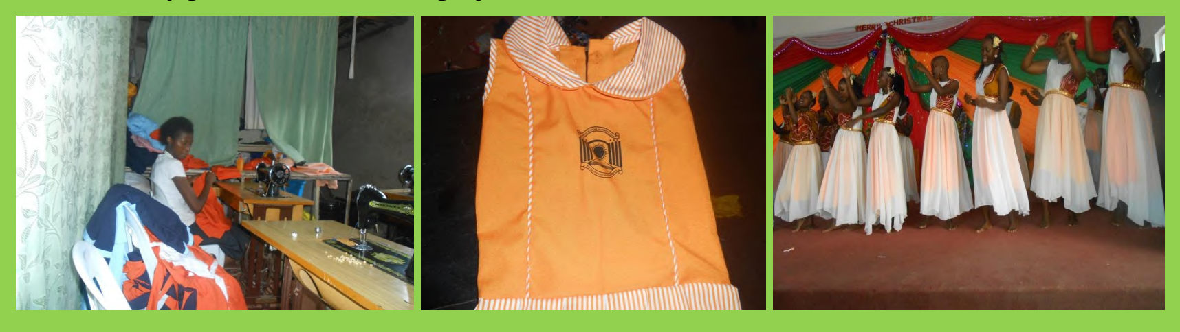
Creating sustainable access to opportunities for sustainability in Kosovo slum & Rural areas of Kampala Uganda. 6 | P a g e

This year our fashion centre has become more active after getting a donation of two sewing machines and tailoring materials. We have gotten a few tenders around and away from our community like churches and schools and we are hoping for the best. It is on our prayer list that God will provide a size 12 knitting machine as this will also help in our sustainability locally. This machine is expensive but worth the investment; it costs $5,100 here in Uganda. We call upon any one who feels compelled to give a 'one-time' donation or a 'group' donation to help purchase this machine. Thanks goes to Mrs. Lynn Root, Mama Thea Smith and Miss Vonnie Walker for the materials they provided toward this project.