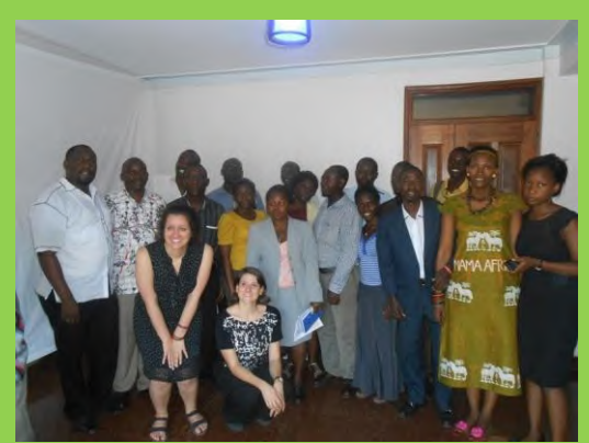
Global Giving workshop in Kampala 2013.