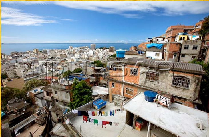
Rio de Janeiro, Brazil (Summer 2012)