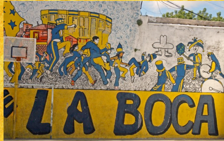
Buenos Aires, Argentina (Spring 2013)