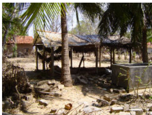
Photographs of the current makeshift Ammen Preschool