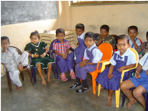
Local school children in Sri Lanka