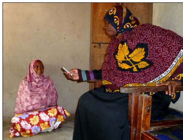
TBA registering a pregnant mother using the mHealth application

With support from the Bill and Melinda Gates foundation, D-tree International successfully implemented a pilot project in Zanzibar Tanzania to achieve safer deliveries. The project was begun in November 2011 and uses an open source mobile health (mHealth) application to reduce the informational, logistical, and financial barriers to in-facility births and post-partum care. The project has trained 24 Traditional Birth Attendants (TBA) from the pilot areas of North A District and Micheweni District in the use of the mHealth application. The TBAs successfully registered 682 pregnant mothers, of which 211 delivered during this period. Between November 2011 and April 2012, health facilities and hospitals in the project areas saw their in-facility delivery rates more than double on average. Additionally, there were no maternal deaths recorded among the registered mothers.